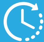
Process Framework Establishment