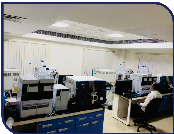
UHPLC & LC-MS/MS