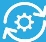
Functional Manual Testing